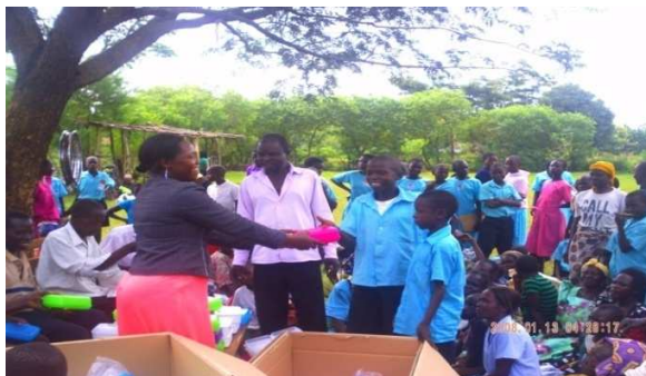
Pajwenda Primary School Pupils