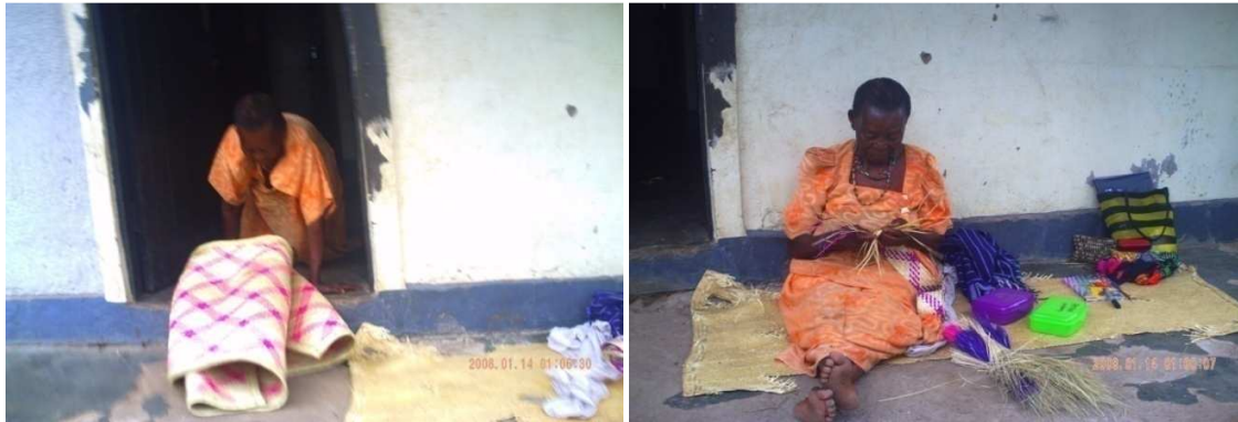
Elderly women are supported to earn a living

RWAYEC with financial help from Akifra has supported women and youth groups to start up economic activities such as catering, poultry keeping and animal rearing, soap making, sewing and knitting among other activities. We have also built their capacity in financial management such as saving, marketing and customer care skills for their small scale businesses which skills they have put in practice and seen their businesses flourish.