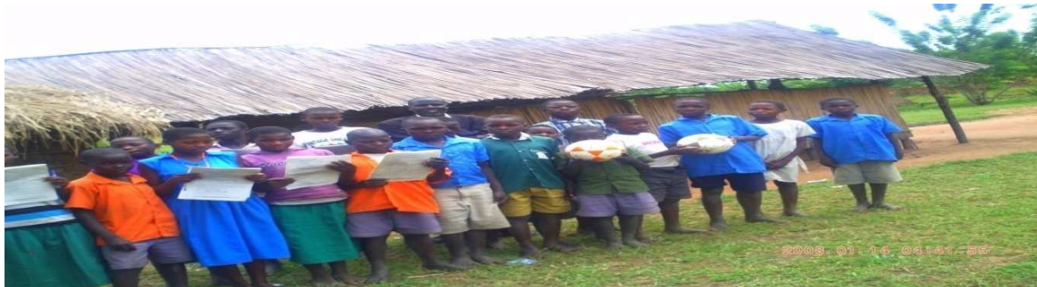
Above are Pupils of Joy Learning Centre Nabuyoga Sub-county supported by RWAYEC with scholastic materials and games equipments

It has equally reduced on the school dropout rate. As government of Uganda grapples with the challenge of Universal Primary Education high school dropout rate especially in the rural areas, where we operate this trend has tremendously reduced because children are able to go with packed food yet lack of lunch at school has been the main challenge.